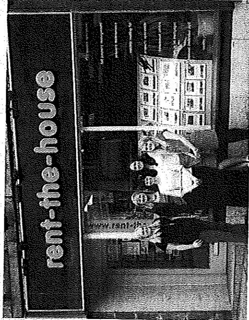
DEDICATED TEAM The ARLA registered Rent The House team

about both the industry and the local property market. Discover for yourself how talented the team at the ARLA registered Rent The House are. Call 08448 731 500 or visit them at 25 Blackburn Road in Accrington, Lancashire.